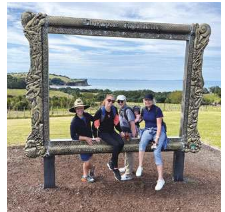
Bloch family at Shakespear Regional park