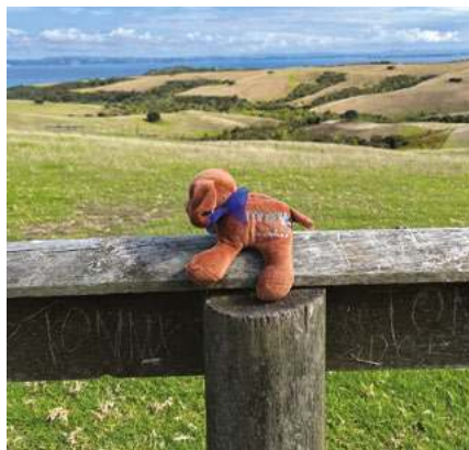
Hope Puppy at Shakespear Regional Park