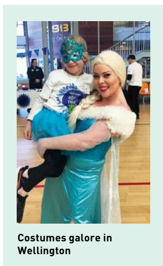
Costumes galore in Wellington

The New Zealand Walk 2 D'Feet MND will take place again in 2019 on Sunday 10 November.