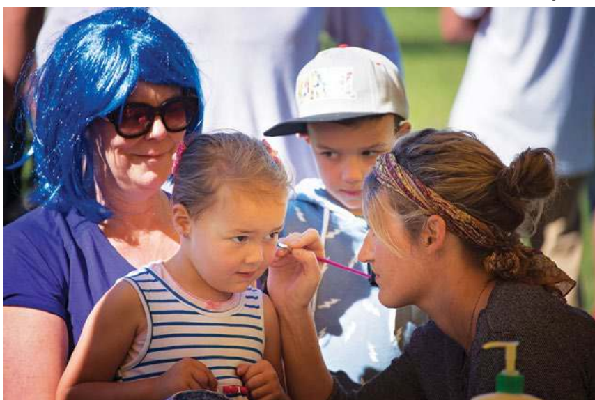
Face painting at Walk 2 D'Feet MND