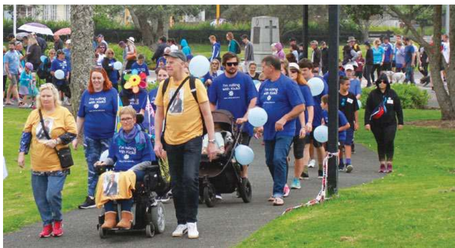
Auckland – The sun shone on the country for Walk 2 D'Feet MND 2018

Tauranga Over 250 people in a sea of colours turned up to show their support for the sunny Sunday event. 60 dogs paraded in costume, and raffles and a silent auction, along with wheelchairs dressed up in blue and cheerleaders with pom poms, made the Walk 2 D'Feet MND in Tauranga a fantastic family friendly day.