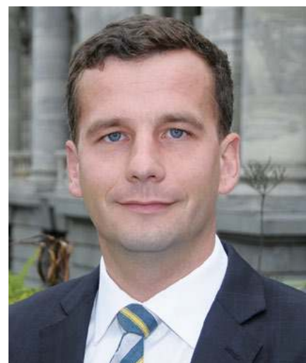
Act MP David Seymour

"There is a myth out there that palliative care and assisted dying are competing alternatives. Places like Europe with good palliative care does not change some terminally ill people still choosing assisted dying."