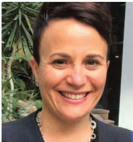
Disability Rights Commissioner, Paula Tersoriero